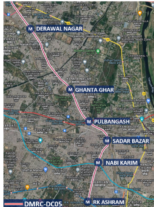
Figure 1. DC-05 Alignment with underground stations on Google Maps.

cross passages and other associated structures based on tender documents and interpretation of the existing geotechnical data provided by DMRC for DC-05 package. The design includes preliminary geotechnical interpretation report, analyses of construction staging and structural design including quantity estimation of temporary and permanent works.