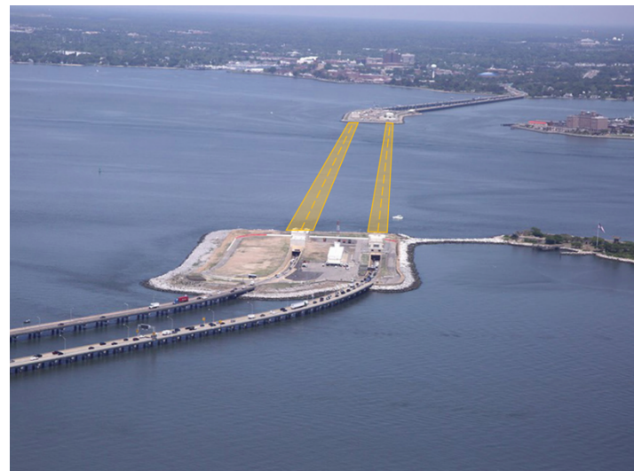
Figure 2. Existing Hampton Roads Bridge-Tunnel with Island Approach Structures and Tunnel alignment indicated by Highlighted Path (Courtesy Virginia Department of Transportation (VDOT)).

Gall Zeidler Consultants (GZ) is providing independent design verification (IDV) services for the tunnel and tunnel approach structures for Mott MacDonald (MM).